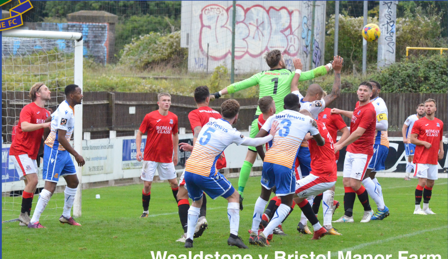
Wealdstone v Bristol Manor Farm

OUR TWITTER FEED: @wealdstone_FC WFC WEBSITE: www.wealdstone-fc.com