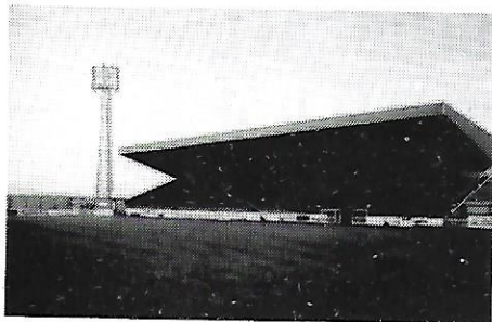
Over 170 semi-professional grounds have benefited from the Trust's grant-aid schemes.