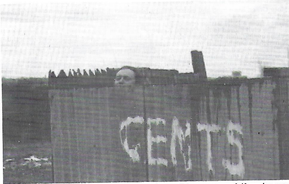
Neale Harveys "Sidelines" column continues this season and if you've ever wondered where he obtains his material... perhaps this is the answer!!