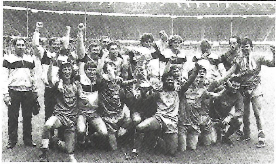
The victorious Wealdstone team at Wembley, May 85