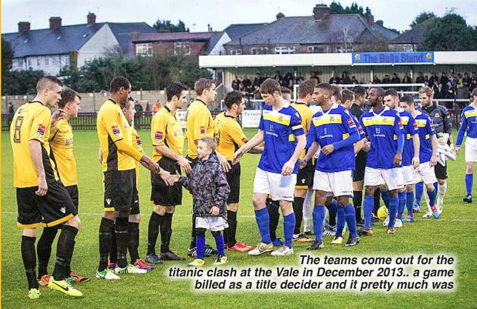
The teams come out for the titanic clash at the Vale in December 2013.. a game billed as a title decider and it pretty much was