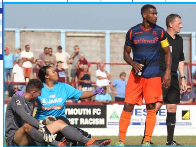
Pictures from our extraordinary 4-3 win last Monday away at Weymouth