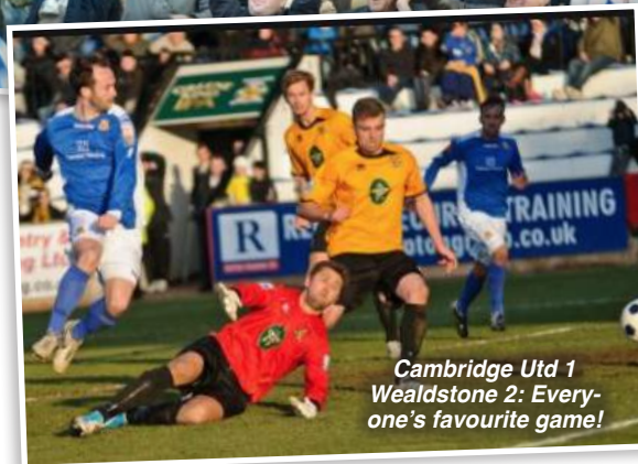
Cambridge Utd 1 Wealdstone 2: Everyone's favourite game!

other moment was when I got a bruised shoulder muscle and was out for a couple of weeks. I went down and ref said to me "anymore and I'll have you in the book". Injustice, eh?