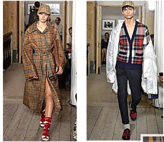
LONDON FASHION WEEK MEN'S FALL/WINTER 2019-20