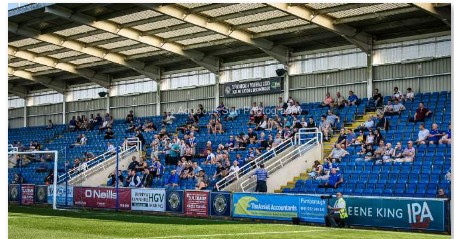
A fine stand and a fine example of extravagant spending

'Good teams find a way to win games when they haven't played as well as they can'