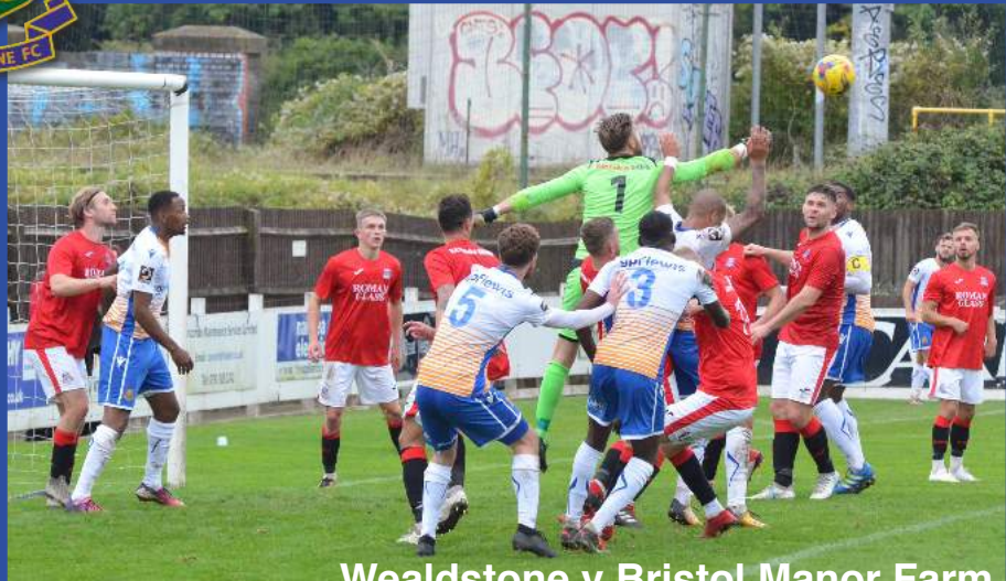
Wealdstone v Bristol Manor Farm

OUR TWITTER FEED: @wealdstone_FC WFC WEBSITE: www.wealdstone-fc.com