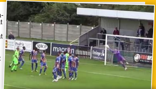
Save of the season? Aston gets across acrobatically to claw away this Oxford City freekick on September 7, somehow flipping the ball over the crossbar. Awesome!