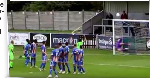
The Oxford players can't believe The Ox has kept it out.. with good reason. Northy reckoned he should've held it