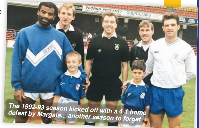
The 1992-93 season kicked off with a 4-1 home defeat by Margate... another season to forget