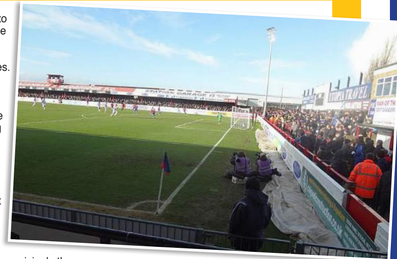
A disappointingly dry Victoria Road, Dagenham

Unfortunately, our 'dead eyed dick' from the spot, Micky Swaysland, had been