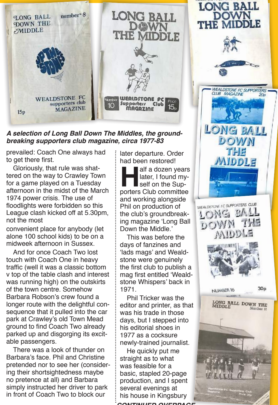
A selection of Long Ball Down The Middles, the groundbreaking supporters club magazine, circa 1977-83

prevailed: Coach One always had to get there first.