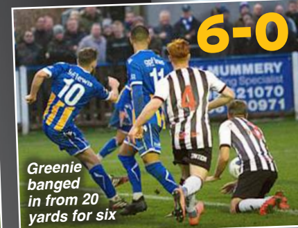
Greenie banged in from 20 yards for six