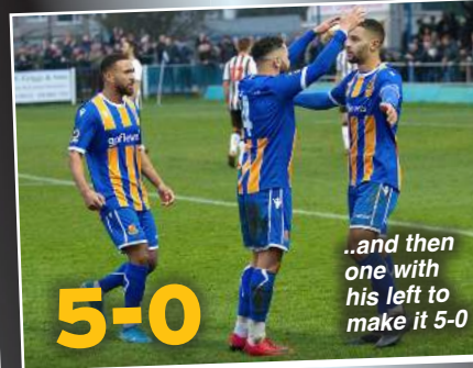
...and then one with his left to make it 5-0