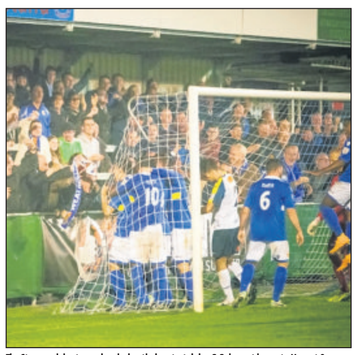
The Stones celebrate scoring during their entertaining 2-2 draw at home to Havant & Waterlooville on Monday night. Waterlooville on Monday night.

Wealdstone have arranged a friendly at home to Met Police this weekend after being knocked out of the FA Cup.