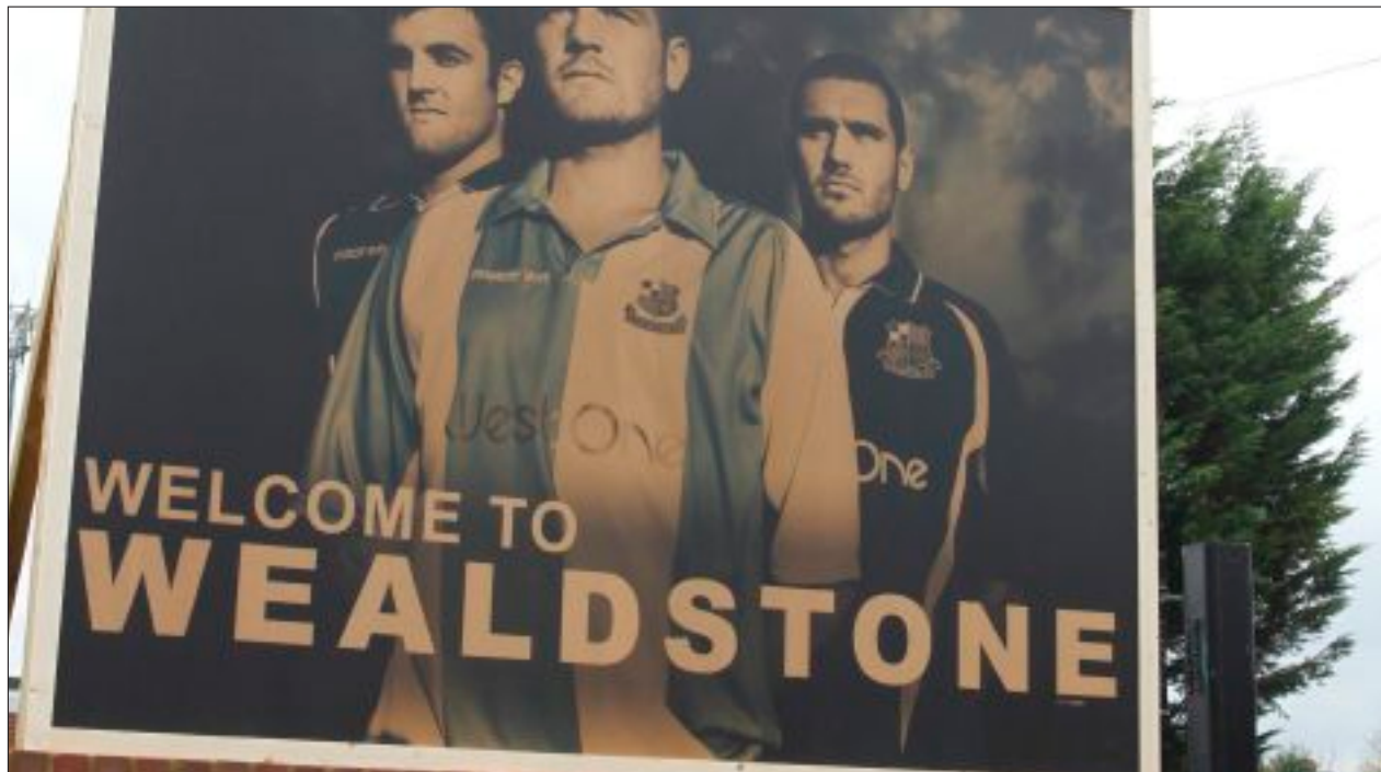
Wealdstone drew 0-0 with Barnet on Saturday taking their winless run in the National League to five matches