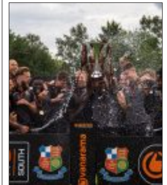
Wealdstone celebrate promotion

LEAGUE TEAMS MEET TO DISCUSS MONEY ISSUES