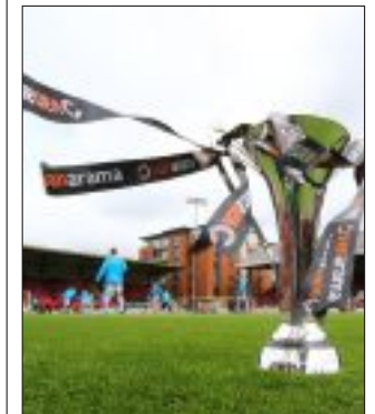
The National League season is still in doubt.

THE future of this season's Vanarama National League remains uncertain with clubs due to meet again this week to discuss a vote on cancelling the remainder of the campaign.