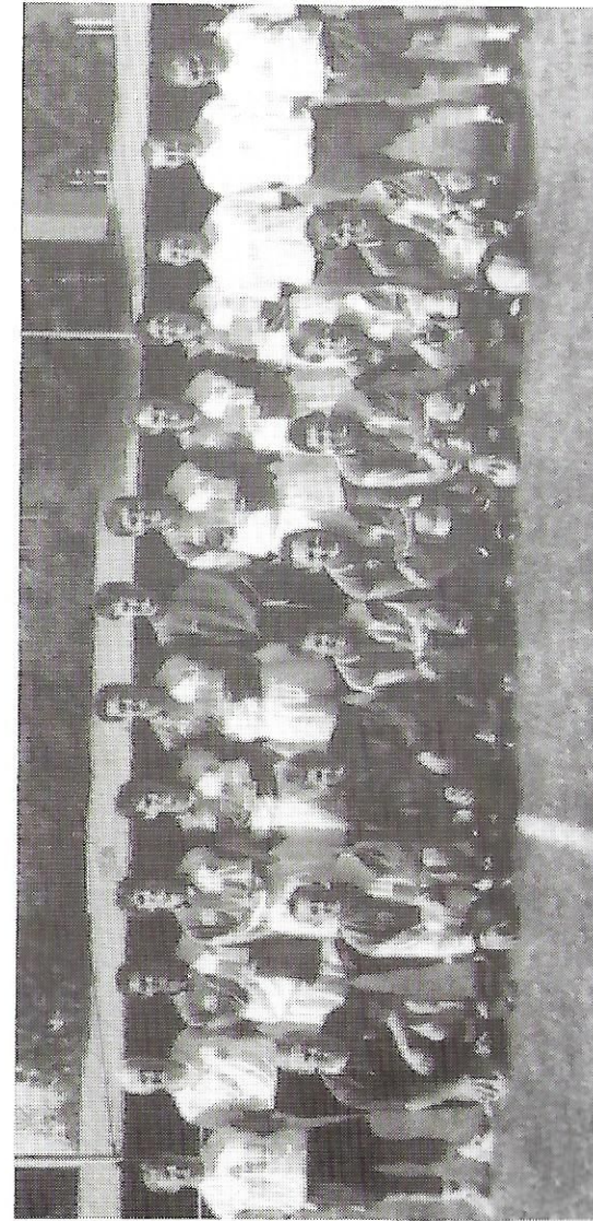
Wealdstone Football Club 1996/97