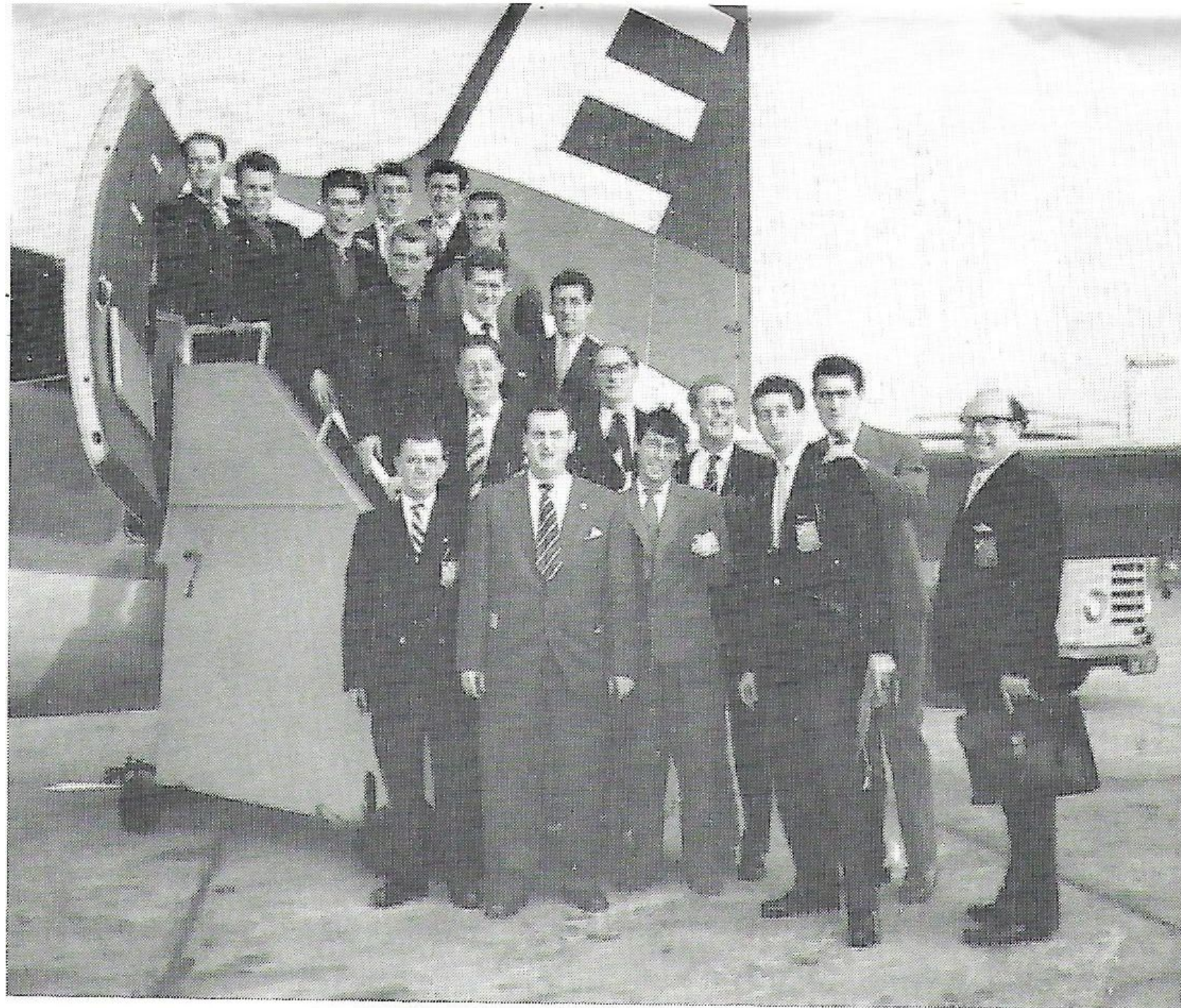
Luxembourg Tour 1960. Players and Officials Boarding Plane at London Airport.