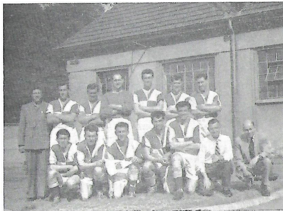
Luxembourg Tour Team 1960.