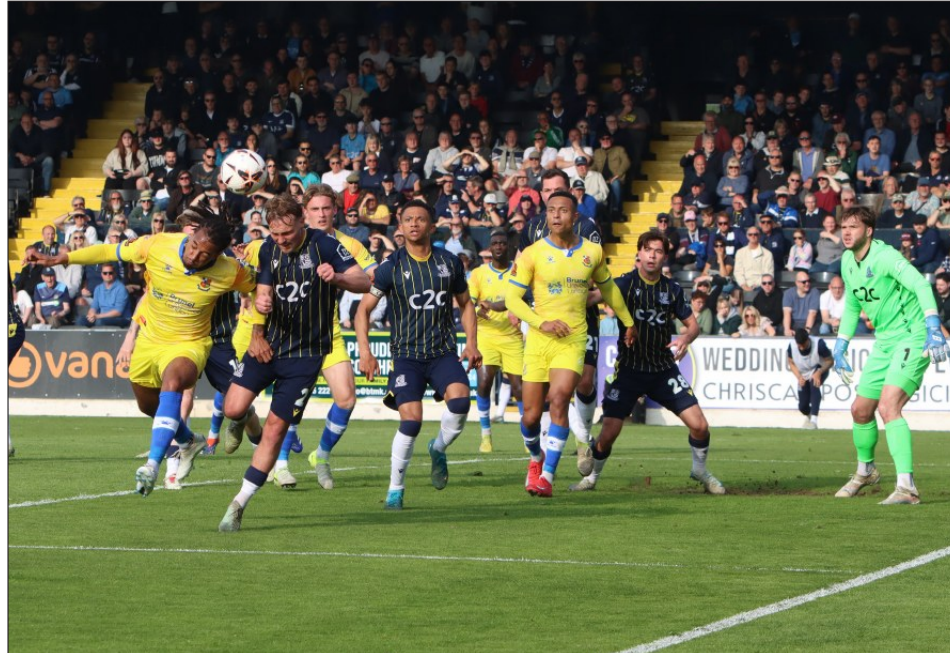
Wealdstone in action at Southend