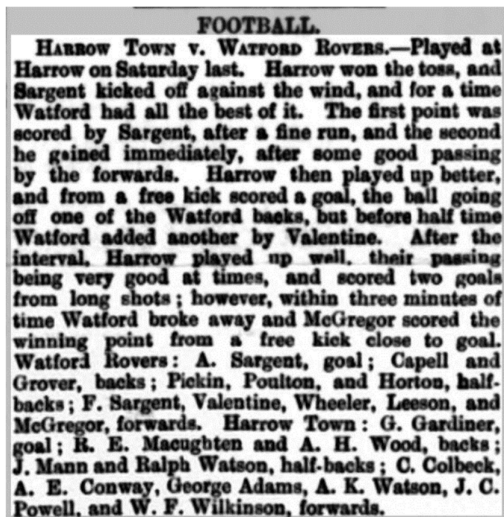
Watford Observer 16 th October 1886

Twenty-five matches in all are recorded across the two clubs for the 1886-87 season, with challenge matches once again featuring local sides and those with the best transport links. The majority of the opponents were clubs that had been established for a number of years and these included Watford Rovers, a forerunner of the Watford FC of today.