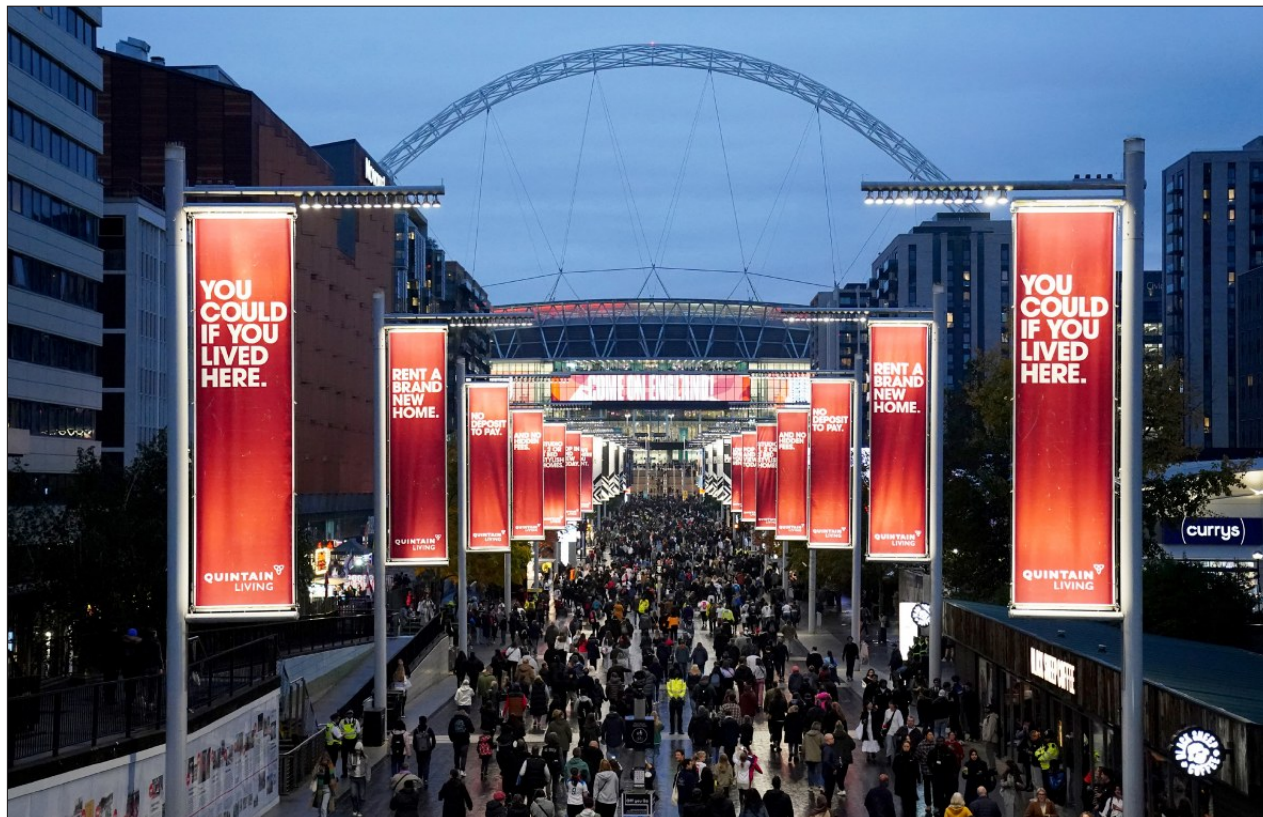
Wealdstone have reached a Wembley final